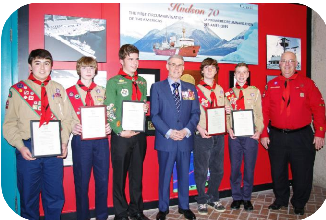
Youth pose with their Chief Scout Awards

I am sure we have lots of Sections throughout Nova Scotia that already qualify/earned or are close to qualifying/earning the Program Quality Award.